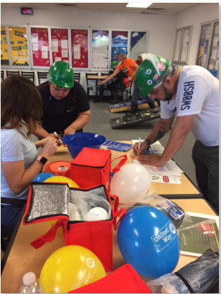
Perdue Farms Campaign Kickoff Event