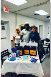
Perdue Farms Campaign Kickoff