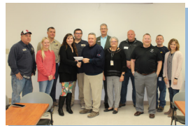
GPC Check Presentation