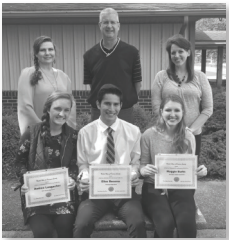
High School Scholarship Awards