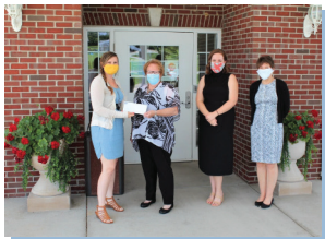
2nd Photo: ERI Recipients, Ketcham Memorial Center, receiving $6,000 for grief counseling for their staff after losing dozens of residents to Covid 19.