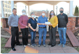
1st Photo: ERI Recipients, Connections and St. Vincent DePaul, receiving $25,000 to serve those in need due to Covid.

UWDC dispersed $200,000 in ERI funds to multiple agencies, qualifying organizations, and schools!