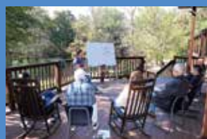
Camp Illiana has been gracious enough to allow UWDC to hold our retreats & provide lunch to our board & staff at their beautiful facility over the last several years.