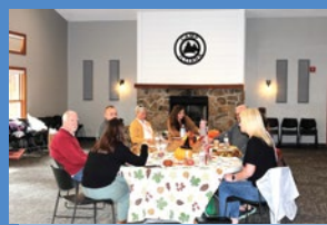
Camp Illiana has been gracious enough to allow UWDC to hold our retreats & provide lunch to our board & staff at their beautiful facility over the last several years.