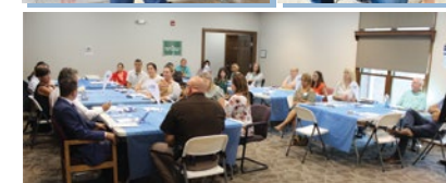
Campaign Kickoff at Scoops & Our Business Coordinator Meeting